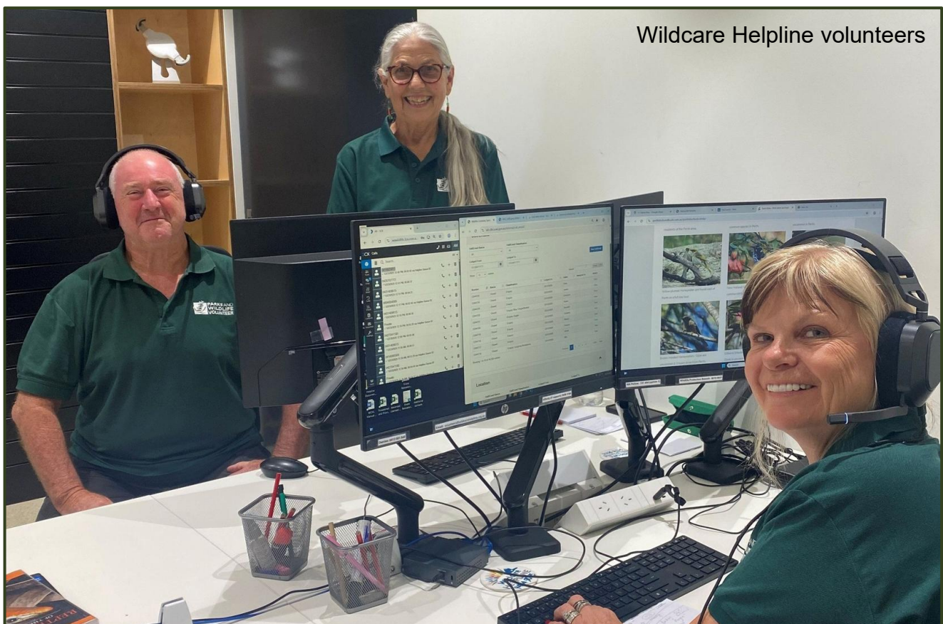
Wildcare Helpline volunteers

The Wildcare Helpline operates year-round and remains a vital link between the community and the wildlife rehabilitation network. Through this service, WA Wildlife continues to support both individual animals and the wider system that protects wildlife across the state.