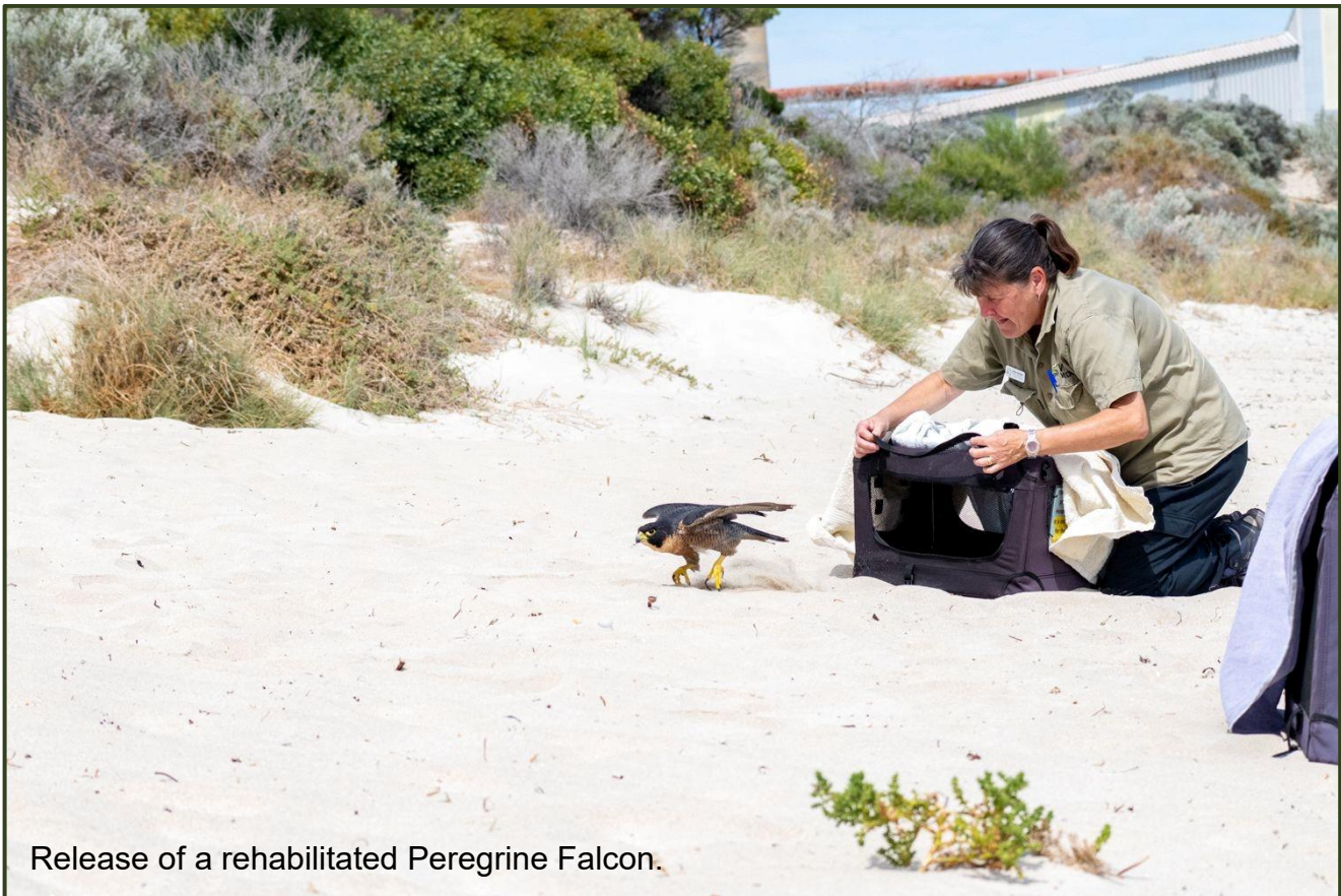
Release of a rehabilitated Peregrine Falcon.

Recognising the complexity and emotional demands of wildlife work, WA Wildlife continued to invest in volunteer training, safety and wellbeing. Structured training programs, clear procedures and ongoing support are central to maintaining safe, effective and rewarding volunteer experiences. Volunteers remain the lifeblood of the organisation, and their contribution is deeply valued.